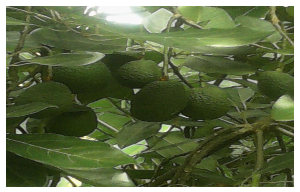
Photo 1: Improved Variety of Avocadoes as Observed in Ilolo Village

Discussion through FGDs and KIIs revealed that some households were involved in the production of improved varieties of avocadoes, which were brought by a settler from Zimbabwe who hired the Rungwe Mission area for the production of the crop. The variety is known as hass (Photo 1).