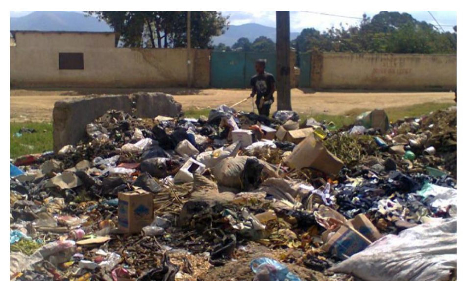
Photo 6: Illegal SW Storage Bay Destructed in Ilomba, Mbeya City

According to Jones and Mkoma (2013), waste charges are operational funds for SWM, particularly collection services from primary and secondary collection stations to final disposal points. A number of respondents in the research area, however, expressed dissatisfaction with the collection of refuse fees due to ongoing delays in garbage removal, insufficient skip buckets, the lack of official receipts of fee payment, and the lack of transparency in the collection and expenditure of fees collected. One of the retired public officials in Iyela expressed dissatisfaction with the monthly refuse fees, citing the lack of information on the expenditure of fees and the late pickup of SW as among the reasons of discontent.