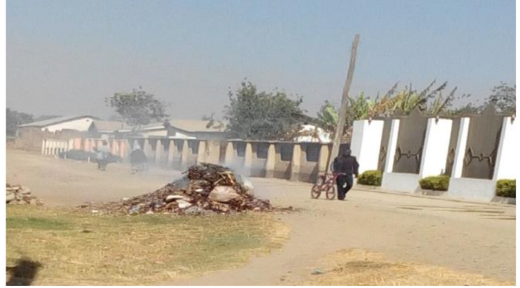
Photo 4: Open Air Burning of SW Due to the Shortage of SW Storage Facilities in Mwakibete, Mbeya City

According to the MCC (2017/2018) report, there were 36 skip containers and 160 litter bins in low supply (Hyera, 2019). Thus, the performance of MSW collection services in Mbeya City is hampered by infrastructural deficiencies, with the majority of SW being managed through open-air burning (Photo 4). One of the forms of air pollution that contributes to the release of greenhouse gases into the atmosphere has been identified as open-air burning (Neurath, 2003; Pansuk et al., 2018).