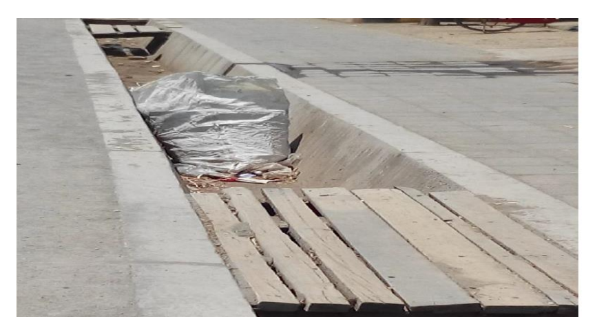
Photo 5: Illegal Dumping of SW along the Road Runoff Drainage Systems at Luanda Ward, Mbeya City

The most difficult aspect of SW collection in the study area was the dispersion of SW in undesirable places. Because of the considerable distance to SW collection stations, scarcity of skip buckets, and the lack of environmental education and awareness, the community members engaged in illegal dumping of SW. The researchers witnessed this during participant observations in Luanda ward: SW was visible in water drainages along the highways (Photo 5); and SW collection bays had been destroyed (Photo 6). According to Okot-Okumu (2012), most cities in East Africa have piled garbage on important roads and highways, eroding public trust in city officials' ability to successfully manage SW.