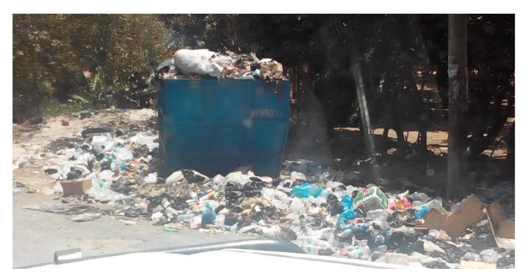
Photo 1: Point-collection of Solid Waste in Mbeya City

In all wards in Mbeya, point-collection was the most common method of providing SW collection services (Photo 1). The communities judged that this technique was the most successful and cost-effective in collecting MSW in their areas. According to Karija et al. (2013), point-collection is primarily used in areas with good access roads to allow hauling trucks to travel and stop by at designated stations in streets for a short period, while alerting homeowners to deliver garbage from their homes. Households are required to leave their garbage at pre-determined sites where some sort of communal collection is stationed under point-collection. It reduces the number of sources from which trucks must collect garbage. However, if waste facilities are not correctly positioned, expenses will rise since people will be less likely to utilise them, and would trash their rubbish wherever they are (Cunningham & Cunningham, 2010).