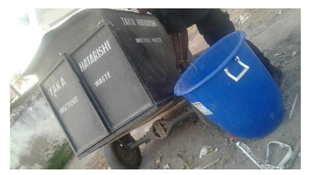
Photo 3: Special Collection of Infectious Waste at the Agha Khan Hospital in Mbeya City