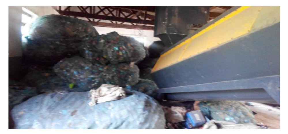
Municipal Solid Waste Collection Services in Rapidly Growing Cities