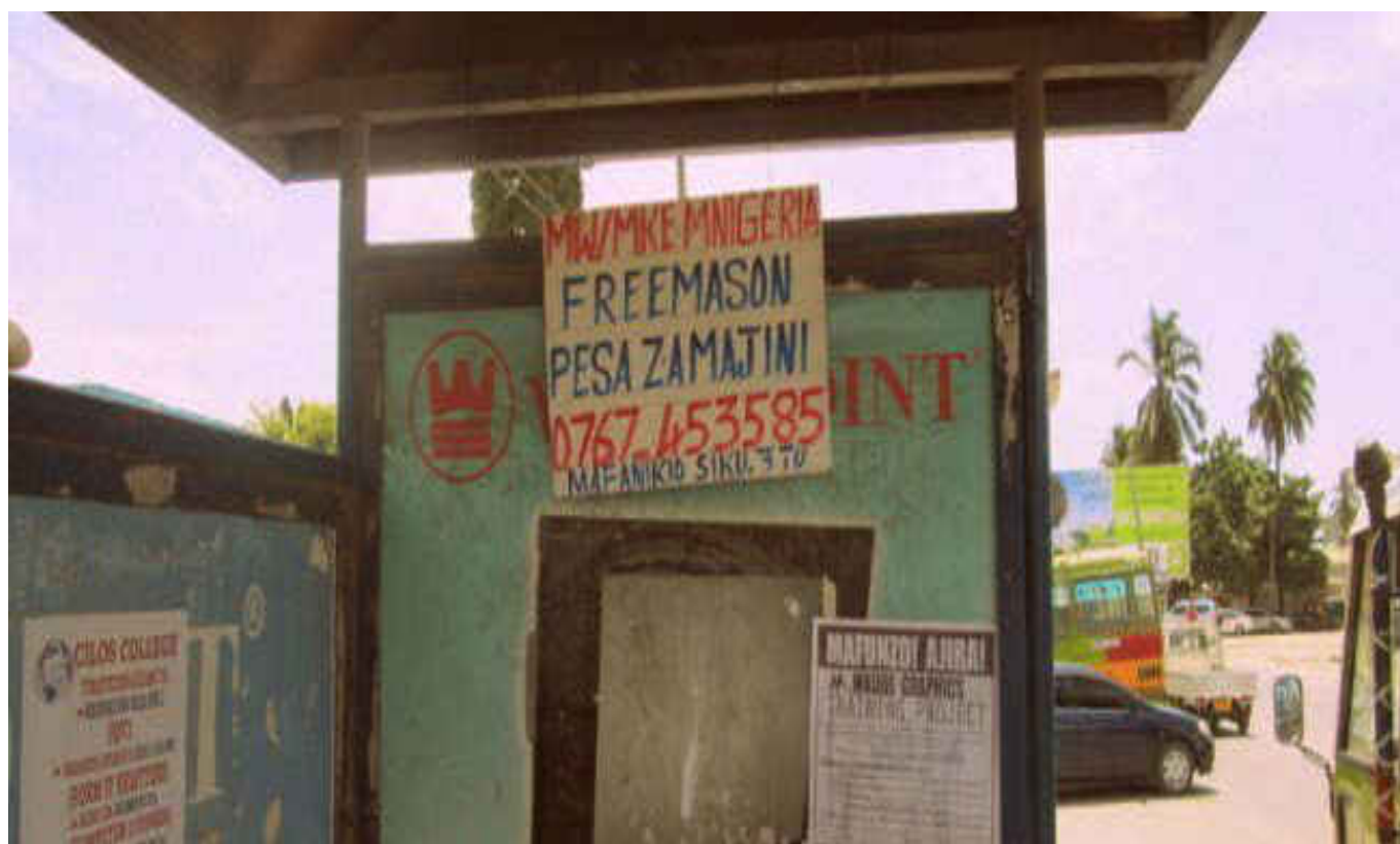
Plate 1: Promotion of witchcraft which lead to murder of Albino

The findings have also shown that poverty, low quality settlement, ignorance, negative attitude, decrease of humanity, and ignorance of some PWAs are also contributing factors to the murders of PWAs,(Plate 2 &3). For example, it has been revealed that almost all murders reported are among of the poor families with PWAs in which even their settlements are worse some with no proper doors in such a way that it is easy for attackers to complete their immorality.