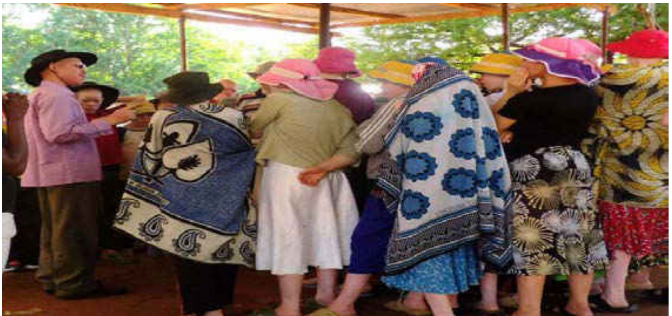
Plate 4. PWAs at Buhangija Center.

Unfortunately, the findings revealed that, Buhangija primary school has been neglected with lack of funds and children are left to take care of themselves leaving them in much greater danger as they have fled from their homes which has led to children leaving in harsh conditions without enough food, learning materials as well as sun screen lotion for protection of their delicate skin(LHRC, 2013) Furthermore, it has been pointed out that, children sheltered at Buhangija have been complaining for being abandoned at the center by their parents and relatives, making them feel like orphans. One of the children at the center had this to say: