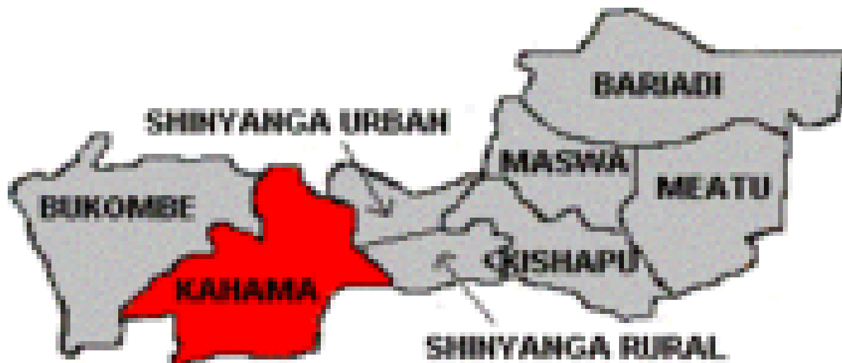
Map 1: A Map of Study Area

The study was conducted in Shinyanga Region located in the Southern Zone of Lake Victoria. Only two districts of that region were included in the study, the districts were Shinyanga and Kahama, (Map 1). Shinyanga is one of the six districts of the Shinyanga Region of Tanzania. It is bordered to the north by the Mwanza Region, to the East by Kishapu District, to the South by Tabora Region, and to the west by the Kahama District.