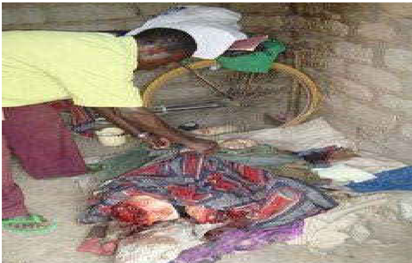
Plate 3: A body of PWAs who was brutally killed in a low quality settlement, the legs PWAs were chopped off