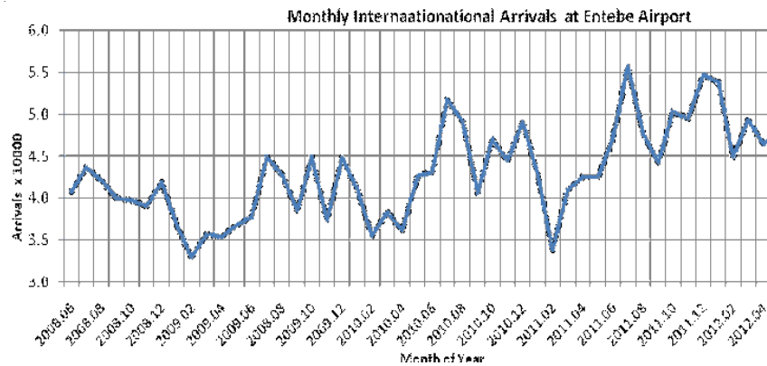
Figure 1: Monthly International Arrivals at Entebbe Airport

A line graph of the collected data is shown in Figure 1. An eye-ball view of the graph shows an increase in monthly arrivals with deviations that are progressively increasing. For example, the deviation from June to July 2008 is lower than that of the same months in 2009 or other successive years. This analysis indicates a multiplicative trend in the arrivals. There are also consistent low volumes of arrivals in some months like February and peak volumes in months of July and December, while overall a seasonal peak period from June to August is recognizable as shown in Figure 1.