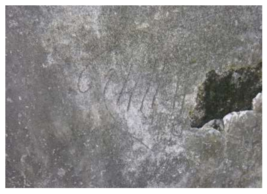
Figure 3: SGA signs from Ivoini, Comoros. See similar ancient signs in Lake Victoria site (Chami 2006a: 83, Plate 1, bottom right)

Other scholars have also found non-Islamic burials of pre-Islam on Mayotte Island of the Comoros (White, 2008b). Our carbon-14 dating results did also produce dates of 1100 CE, which is quite early for Islam in some parts of this coast of East Africa (Horton & Chami, 2018). In a nutshell, my opinion came to be that probably African non-Islamic people continued to survive for a long time, and continued to use traditional SGA script already known on the islands as indicated in Madagascar (above). Ibn Batutta reported of such die-hard people in Kilwa, still fighting against Islam in the 1330s (Gibb, 1939).