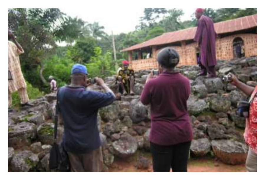
Figure 6: Masses of slags arranged as seats in front of the palace at Lejja

Many roundish masses of slags were arranged as seats in the ancient palace for people to sit on during meetings or other occasions as done today by the local people of Lejja (Figure 6). It is not certain when the arrangement of slags at Lejja was first done, but it is conjectured by the local people that it was like that in ancient times because their ancestors found them thus. The palace area is also marked by conical pinnacles, which were probably used for astronomical cultural activities (Opata, 2008; Urama, 2008). The lowest levels of Amaovoko trenches were also found to have some potsherds with bevels and flutes like those of the Early Iron Age Urewe tradition in East Africa (Soper, 1971). However, some were flared, which is not an attribute of the Urewe. Some shards, particularly those flared, were also of reddish smooth fabric, probably imported to the area.