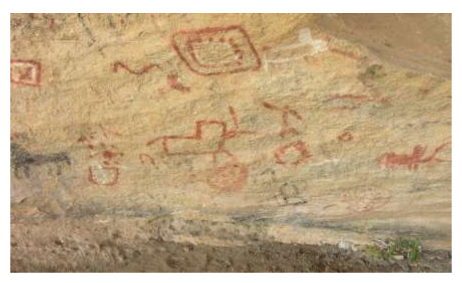
Figure 1: Observe long-honed and humped cattle of Isalo rock paintings

The paintings on the wall (Figure 1) were a phenomenon to me. The images were similar to those I had seen in other parts of Africa that I had visited: Namibia (Wilcox, 1984); Namorutunga, Kenya (Lynch & Robbins, 1977); and elsewhere in Tanzania (Chami, 2006, 2008a). After the Isalo work, I travelled with Nado and other students to Namorutunga (Map 1) for a comparative work on the SGA phenomenon. The red and black paintings are dated elsewhere in Africa to the early farming and Neolithic period (Willcox, 1984; Chami, 2006). The appearance of the images of humped cattle became very interesting to me because they are also found in other parts of Eastern Africa as an indication of early domestication, probably of the Neolithic period; and now testified in Madagascar (Rasolongrainy, 2013). In the survey work on the site, we found Late Stone Age stone artefacts. After I had left Madagascar, Nado also recovered this kind of stone tools from excavations. He also recovered cuneiform pottery of Nderit Neolithic tradition that was similar to that of the rest of East Africa (Barthelme, 1985; Rasolondrainy, 2013; Chami, 2006b) (Figure 2).