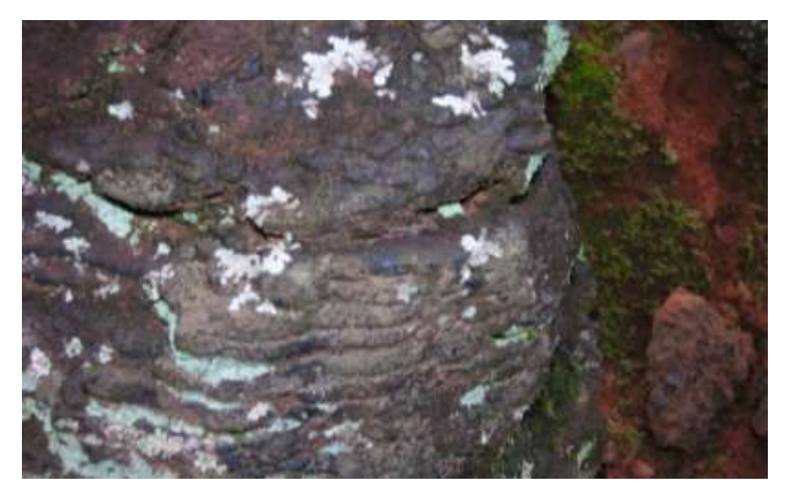
Figure 5: A slag mass of concentric rings from Amaovoko, Lejja.