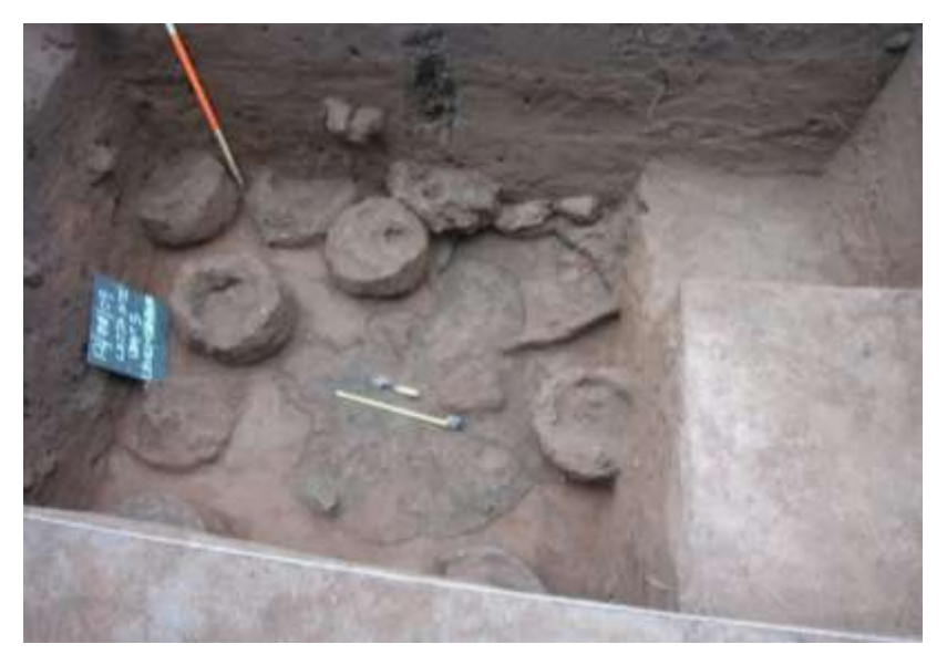
Figure 4: Several arranged ancient furnaces at Lejja

Mapunda of the University of Dar es Salaam accompanied me once for his expertise in iron technology. The site has many impressive furnaces with roundish masses of slags (Figure 4). Some slag masses are of layers or concentric rings, suggesting that the liquid slag was taped to form such masses (Figure 5). Such technology was also reported from the Lake Victoria region with the same dates by Schmit (1978).