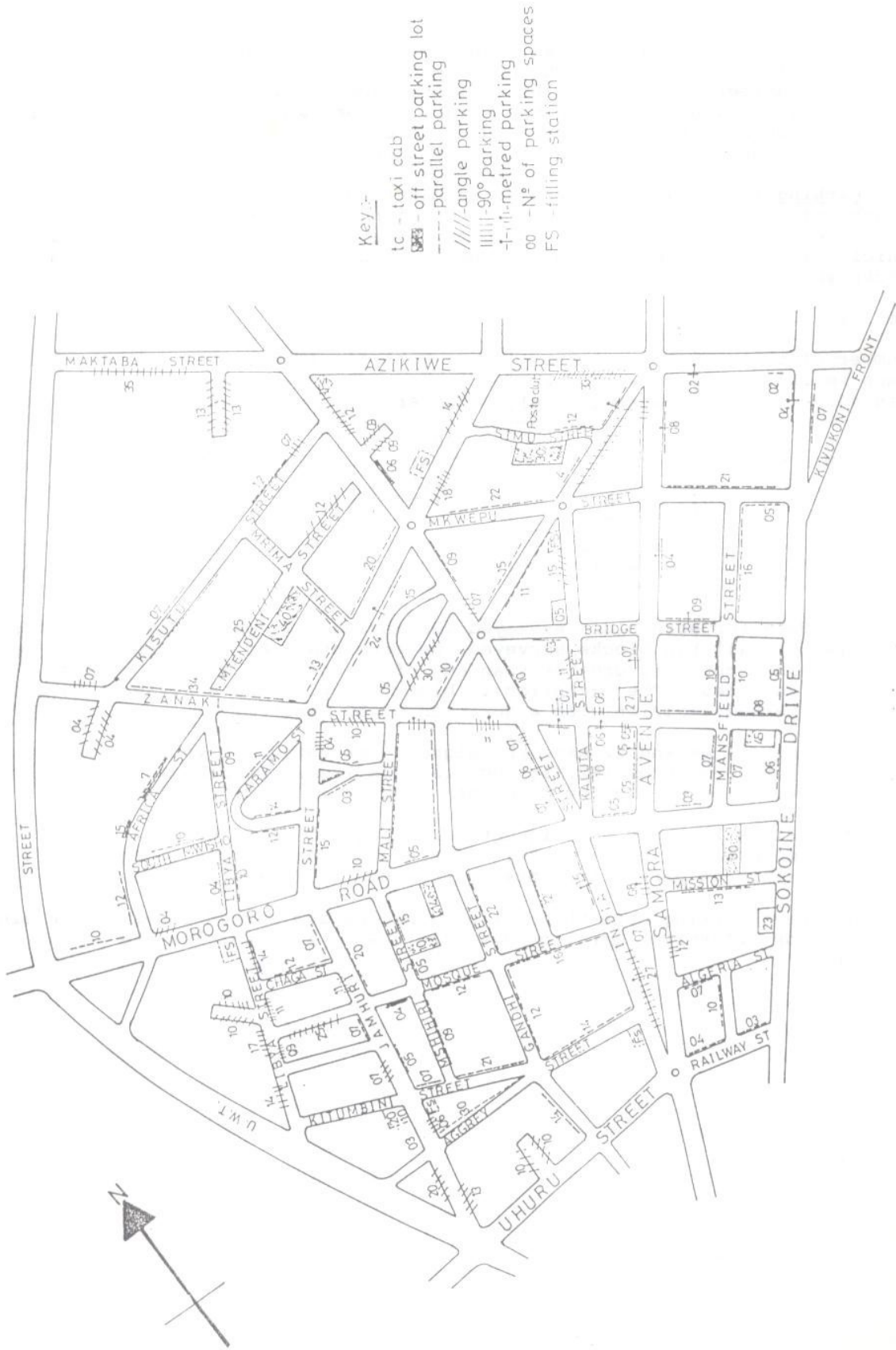
Fig. 2: PARKING SPACES INVENTORY DATA.