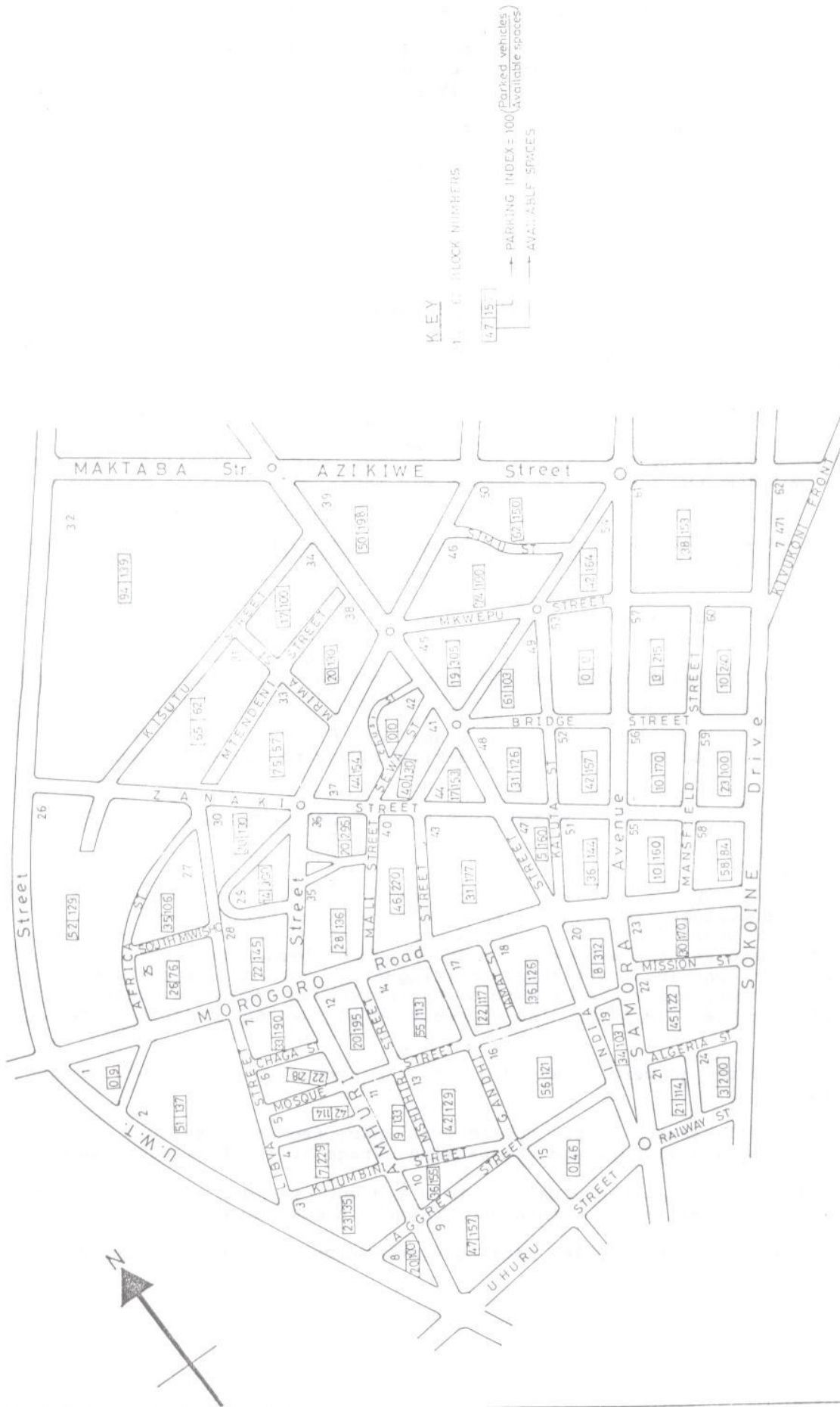
Fig.1: NUMBER OF AVAILABLE PARKING SPACES AND PARKING INDEX