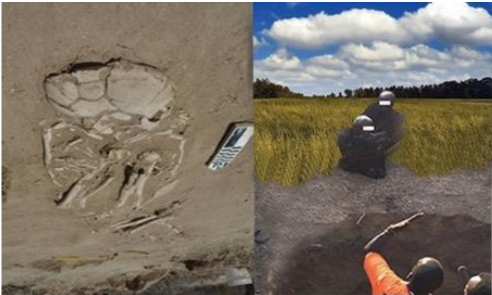
Figure 4. Left is a corpse of an adult female encroached in a supine position and directed toward the East at Nguvu-Kazi; right is a burial ceremony of Datoga adult female encroached in sitting positions, and directed towards the East at Olpiro ( Field data 2019 and 2020 )

The distinctive post-trauma characteristics indicate that the corpse from the Grave I had a round scar on the frontal bone. The defunct was probably wounded during his lifetime. However, the wound was likely not the actual cause of the death. The trauma was not definitely due to either a sharp or a projectile wound; maybe it was due to a blunt wound. A corpse from Grave III appeared to have a fracture on the innominate bone that had bevels, suggesting that the wound was perimortem trauma. In general, all the corpses excavated had postmortem fractures resulting from compression and tension forces of pile stones. Almost all the long bones were broken three times or more. The skulls were cracked several fractures, a situation that posed a significant challenge during the analysis and the conjoining process as a whole. The actual application of burial procedures revealed at Nguvu-Kazi has been inherited and used by an indigenous group in the Lake Eyasi Basin (Figure 4).