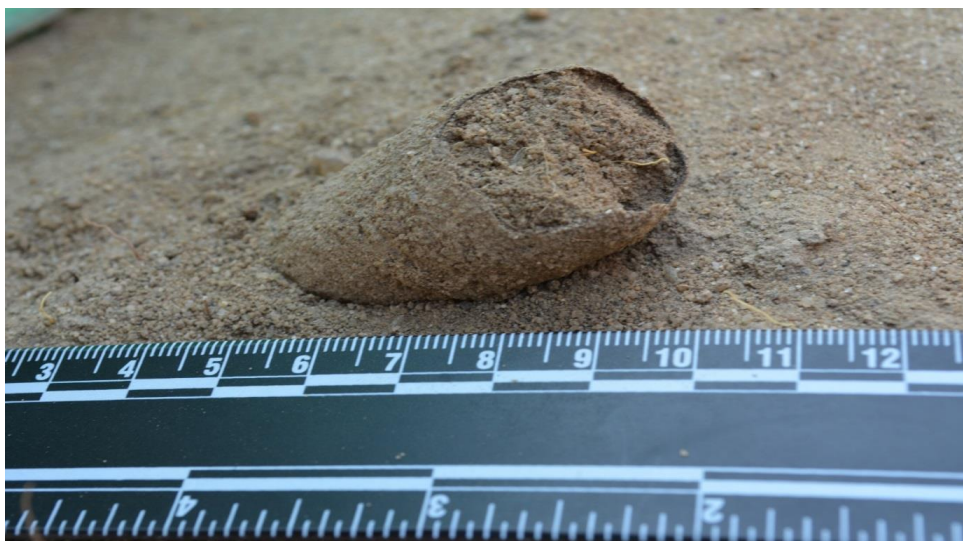
Figure 3. Crown eggshell buried with an adult female at Nguvu-Kazi

As noted in previous sections, corpses at Nguvu-Kazi were buried in varied orientations: two individuals were buried in a crouched sitting position towards the East. The rest were buried in a crouching posture. For the latter, the knees were bent, and the upper body was brought forward in supine position. One corpse was oriented supine, with both hands along with the site and directed towards the East. Two corpses were buried together in different directions, one facing the East and another one facing the West. These interment arrangements often incorporated a number of different elements such as respect to the dead, religious devotions or cultural practices. Objects buried with the bodies had different connotations regarding the corpses, including religious aspects, the wealth of an individual, marital status, personal skills and other values, depending on the community involved (Houck, 2010). They are also significant indicators in crime scene investigations (Merck, 2013). The investigations are normally used by criminal investigators to demonstrate the cultural aspects and exhumation taboos especially in places with different cultural groups. Sometimes, they have been used in establishing the link between suspects and victims (Merck, 2013).