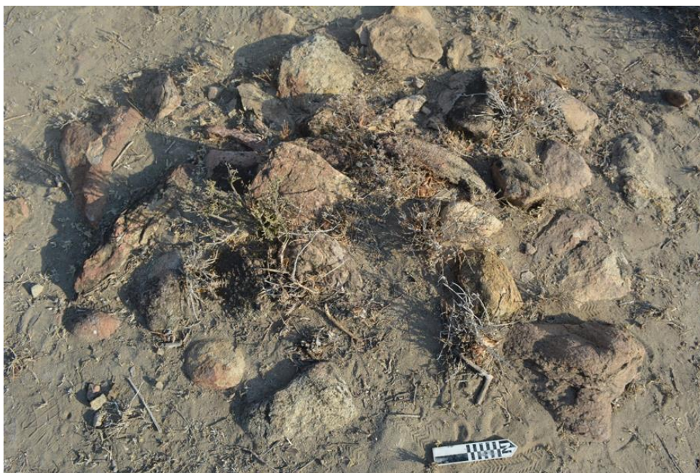
Figure 2. A mound of rough stones piled together as a landmark of burial cairns at Nguvu-Kazi in the Lake Eyasi Basin

The excavation procedures followed both cultural and natural strata whereby cultural sequences were subdivided into 5 centimeters (cm) spits and went down almost 60-100 cm below the surface. Vertical and horizontal excavations procedures were used to exhaust buried individuals. The exhausted burial cairns were mapped in two meter transections. The trench was further extended in different directions depending on the orientation of buried individuals (Fulginiti, 2014). The excavation processes involved a detailed description of sedimentary deposits, reassessment of burial practices, and collection of all associated archaeological materials, including reliable samples for radiocarbon dating.