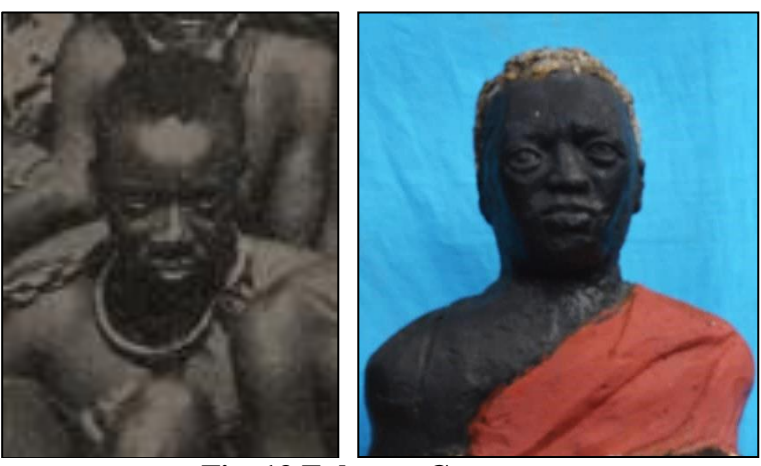
Fig. 13 Fulatera Gama